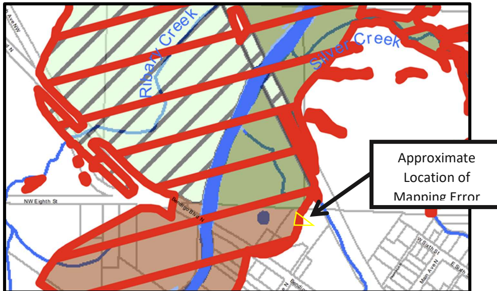
Figure 1: Subject Area of Shoreline Designation Error