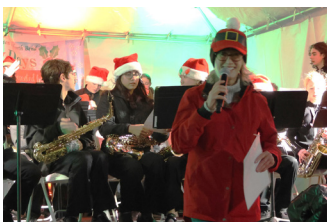
Holly Days, our winter festival, is usually held the first Saturday in December.

with me. As the countdown to the big lighting commenced and local kids danced and sang, my voice blended in with yours, resulting in a collective joy that can only be described as authentic holiday spirit.