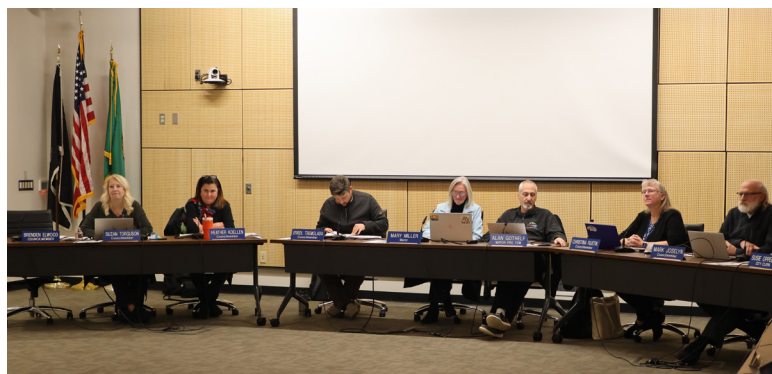
The 2025-2026 Biennial Budget Ordinance was adopted at the December 3 City Council meeting.

This month, the Council adopted the 2025 - 2026 Biennial Budget Ordinance, following three public hearings and several Council budget workshops.