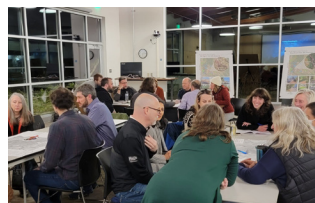
Residents attended a series of Master Plan workshops in 2023.

You've likely heard about the Master Plans for Taylor and Riverfront Parks, or perhaps you attended one of our planning workshops this past year where we collected your input alongside the City's consultant, Site Workshop. Master Plans for both parks are now complete! Construction on an initial phase that will address the McClellan Avenue right-of-way and railroad track improvements in front of Taylor Park are anticipated to begin this next year and continue into 2026. Staff are applying for grants to develop park improvements, and once awarded, these grants will be matched with park impact fees and other city resources to permit a series of phased improvements that follow both respective Master Plans.