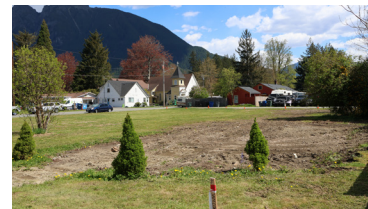
230 Main Ave, a future affordable homesite.

Part of planning for our future here in North Bend is continuing our work in ensuring a diverse array of housing options. The City's purchase last year of 230 Main Avenue N will provide rental apartments for local workers, affordable to families making not more than 60% of the King County Average Median Income (AMI). With staff input, the recently selected developer, Related NW, issued a Request For Proposals (RFP) for an architect. As part of the design process, the selected architect will host two public open houses to gather input on the design of the project.