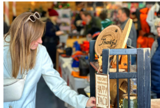
Locals supporting local businesses at the December 14-15 Holiday Pop-up Market.

Seasonal beautification of this magnitude is not possible without the hard work and collaborative efforts of the North Bend Downtown Foundation, a nonprofit organization dedicated to enhancing our downtown and supporting local businesses. The result is an exciting, appealing and productive place for residents to live, work and play.