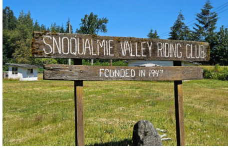
Six-acre property donation to Si View Metro Parks

Located in North Bend on the south side of Interstate 90 near exit 31, Si View Metro Parks is right now collecting community feedback on future recreation uses for the park, planning for space that additionally incorporates educational programming and interpretive signage to commemorate the Riding Club's history and generous public gift.