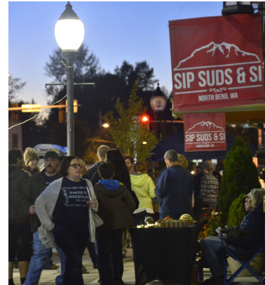
Snoqualmie Valley Art Studio Tour, and seven years of Sip, Suds and Si in North Bend

I look forward to a collective Valley-Wide Volunteer Day with you and Love Snoqualmie Valley on October 4, followed by JazzClubNW's North Bend Blues Walk.