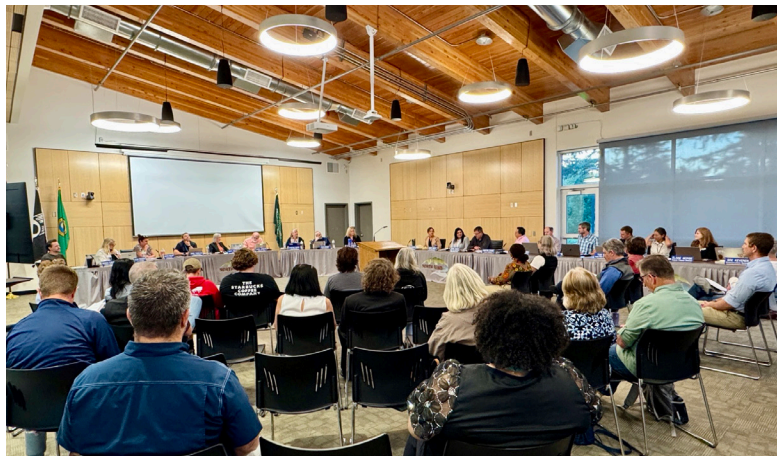
September 16, 2025 North Bend City Council meeting

At the September 16 City Council meeting, we made huge strides in our work to ensure a safe and secure transition in police services , shifting from the Snoqualmie Police Department to the King County Sheriff's Office. North Bend councilmembers voted unanimously to approve a new interlocal agreement (ILA) with the City of Snoqualmie. The new ILA, also approved by Snoqualmie's Council on September 15, requires the city to dismiss the lawsuit filed against North Bend, and it enables that successful transition in April, 2026.