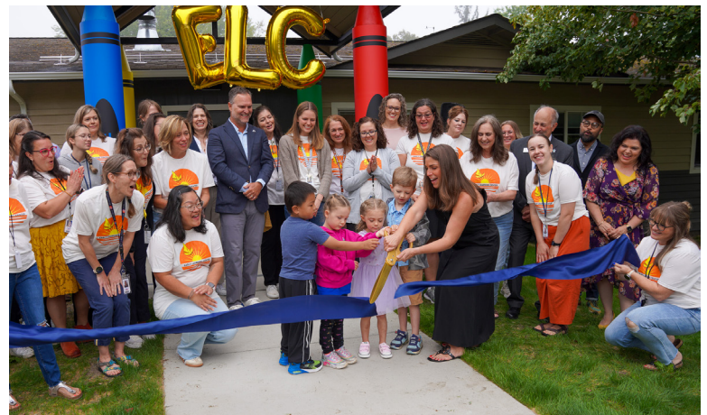
Snoqualmie Valley School District's Sept. 2 Early Learning Center grand opening in North Bend