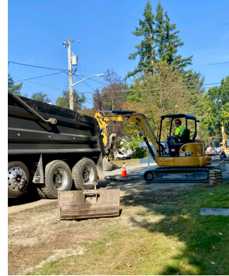
5th St, 6th St, Main Ave Improvements

Pedestrian connectivity and stormwater drainage improvements are on the horizon for the Old Silver Creek neighborhood, with the 5th Street, 6th Street and Main Avenue Improvements project. By January 2026, these streets will have curb, gutter and sidewalk, drainage swales, stormwater catch basins and a storm pipe network. Additionally, a portion of Main Avenue near the intersection with the Snoqualmie Valley Trail will be slightly lowered to increase sight distance and enhance pedestrian safety.