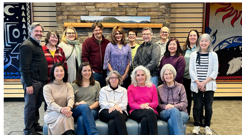
Graduates of the 2025 North Bend Citizens Academy

In November, registration will open for the city's annual Citizens Academy ! This course offers an in-depth look into city operations, and it shares paths to a variety civic engagement opportunities. I attend many sessions and truly enjoy the opportunity to get to know our participants.