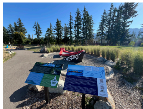
Snoqualmie Tribe interpretive signage at Dahlgren Family Park

Accessible parks, trails, and open spaces are an integral part of North Bend, and this quarter, I am pleased to share with you a few updates.