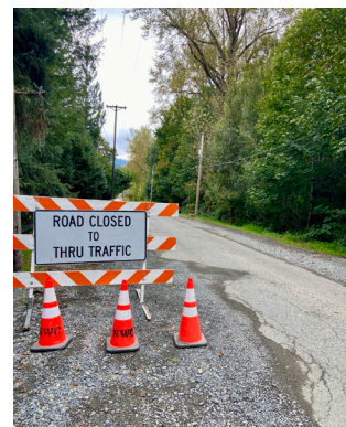
Sewer ULID work on NW 8th St

Your patience and understanding are appreciated by everyone – crews onsite, city staff assisting and your elected officials who are out talking with residents.