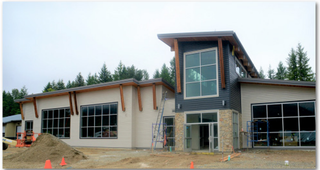
New City Hall during construction, 2019.