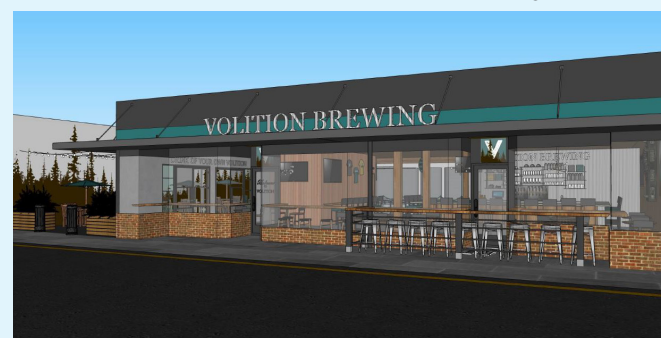
Rendering provided by Craig Glazier