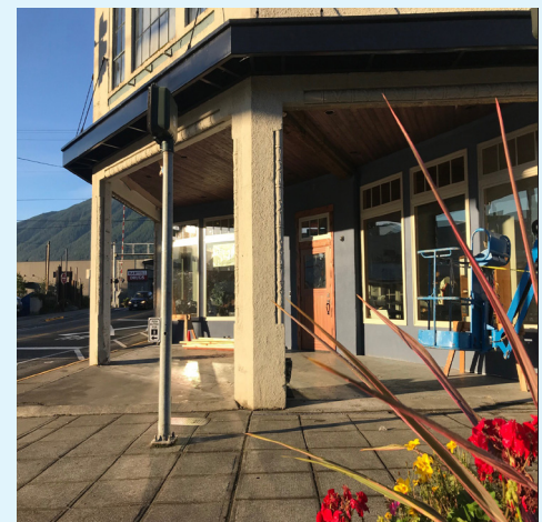
Sunset Garage, October 3, 2018

For more: www.gofundme.com/rescue-north-bend-historic-building