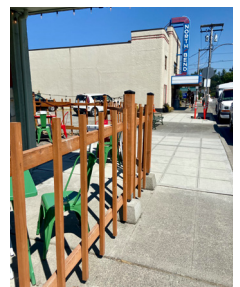
Annual Sidewalk Repair Downtown

Contractor crews will soon complete Forster Woods repairs and are hard at work in other areas of downtown North Bend where they are removing and replacing numerous street trees that have outgrown narrow landscape areas. The resulting cracked, broken, and lifted sidewalk panels and driveways are being repaired. The downtown street trees with tree wells will be replaced this fall with new ones that are more suited to these environments.