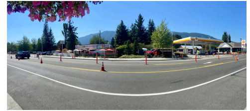
North Bend Way Sidewalk Project

Work is well underway along the busy corridor of North Bend Way between Ballarat Avenue North and McClellan Avenue. As part of the Sidewalk Gap project,