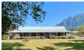
North Bend Train Depot Roof Rehabilitation

In July, contractors wrapped up work on the Train Depot Roof Rehabilitation project, with the help of a $150,000 grant from the Washington State