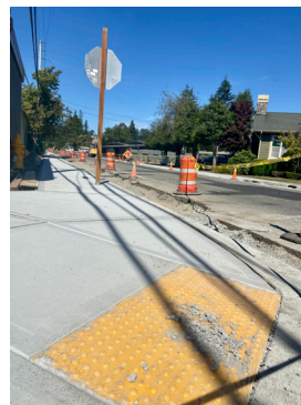
2nd St. Watermain and Road Reconstruction

We recognize that a big part of responsible water use is to conserve the resource as we use it. August 15 th marked our third year of formal water conservation within the City under our Water Conservation Ordinance. Thank you for once again setting a positive example for the entire region by joining us in taking voluntary measures to conserve water. The good news is not only are you doing a great job, but it has also combined with a great “water year” and our mitigation