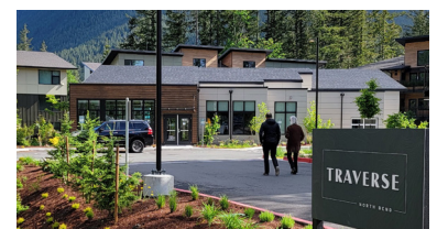
Traverse apartments, at 436 th Ave SE.