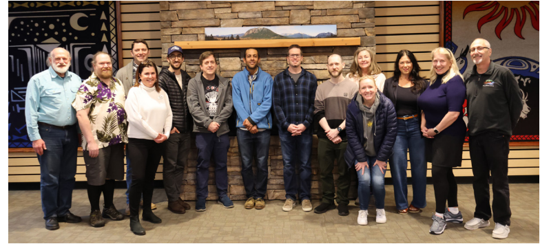
Citizens Academy graduates connected with councilmembers at the April 8 recognition event.

In April, we celebrated 17 North Bend Citizens Academy graduates. Now its second year in operation, the eight-week course guided people through various aspects of city operations, including administration and history, legal, public records and information, parks, finance, fire and police, public works and infrastructure, and community and economic development. Participants were deeply engaged in learning throughout the process, and we look forward to seeing how they choose to engage with the City moving forward.