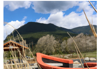
Dahlgren Family Park is expected to open in the summer of 2024.

Walking, biking or driving on Southeast North Bend Way, you have likely noticed continual activity just east of the Timberstone Condominium development. What you are seeing is Dahlgren Family Park, a four-acre space that will soon be open for mountain viewing, pickleball, volleyball, playground adventures, picnicking, and walking, with a new trail connection to King County's Tanner Landing Park. We are as eager as you are to get in there and test it out, but it's not quite ready yet. I am hopeful that by summer I will be wielding those giant scissors yet again and cutting that ribbon so that we can all fully enjoy another new city park.