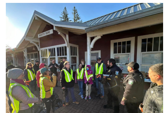
NBDF Meet-Up Clean-Up monthly event.

We've had some downright exquisite (and wild) spring weather this year. Whether it is community litter clean-up with the Downtown Foundation, or landscaping and winter clean-up at home, residents are busy preparing for another beautiful North Bend summer. Your city is ready, too! We brought back the useful North Bend Yard Waste Program on select Saturdays at the North Bend Public Works building. Funded by the King County Waste Reduction and Recycling Program, this event is an appreciated service that will continue through October.