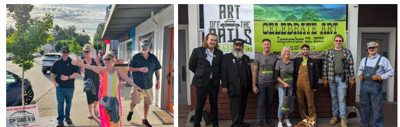
Sip Suds and Si and Art Off the Rails are two spring events that bring community out to play.

Community spirit and support for our local businesses and organizations is alive and growing here in our mountain town. I saw so many of you enjoying live music downtown at the JazzClubsNW's Jazz Walk in April, and businesses were packed last month at the North Bend Downtown Foundation's Sip Suds and Si event.